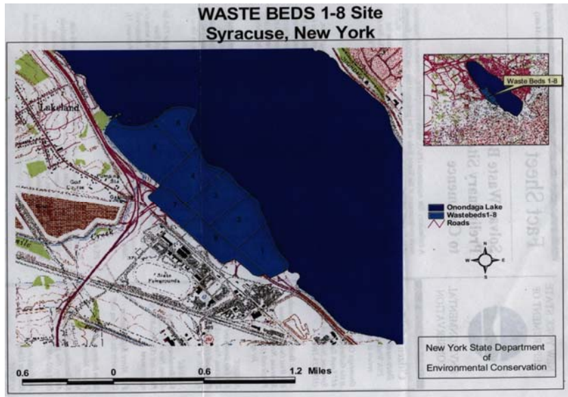
Figure 1: Waste Beds 1-8 site map

A New York State Superfund Site (Registry #734081)