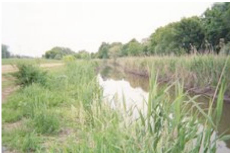
Figure 2: Photo, looking west, showing Ley Creek. The dredgings are under the grass covered mound on the left (south) side of the creek.